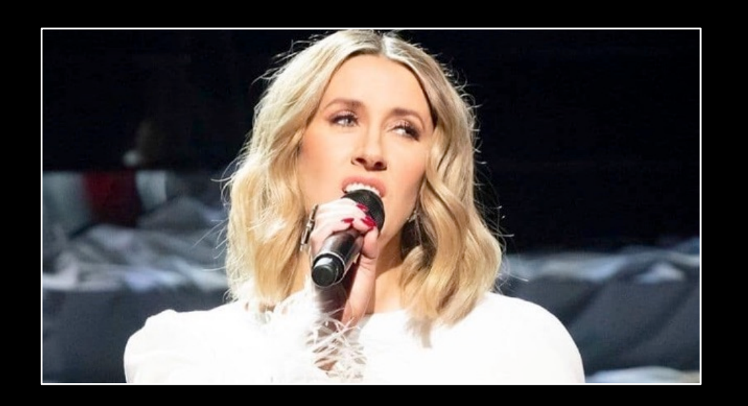
"It's a great song and happy to have been the voice for it!!!"